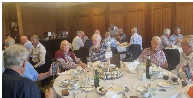
Figure 22. Bobbas at Kooyong Lawn Tennis Club

I am writing this report on behalf of the Bobbas community. The Bobbas reflect our Clubs strong Surf Lifesaving History going back to 1955 when the Club was born.