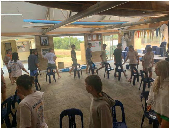
Figure 29. Lion's Den social night activities

Most importantly, following the U16s achieving their Bronze Medallion in December and the U15s completing their Surf Rescue Certificate skills maintenance, the Lion's Den group made a positive