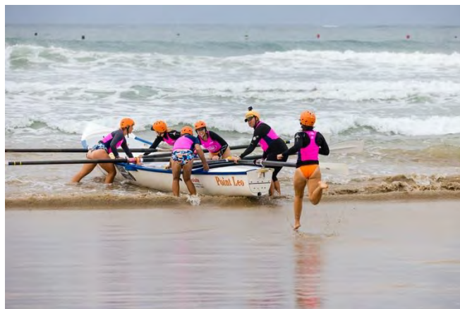
Figure 13. The Mimosa's at state championships, Ocean Grove