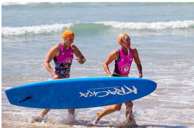
Figure 14. Our ladies bringing it home in the board rescue at state championships, Lorne