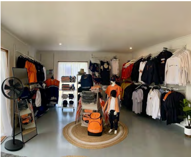
Figure 30. Remodelled uniform shop

Sandra and Mel invested considerable effort in styling and decorating the shop space, creating an inviting atmosphere for members. Their attention to detail ensured that the presentation of merchandise was visually appealing, enhancing the overall shopping experience