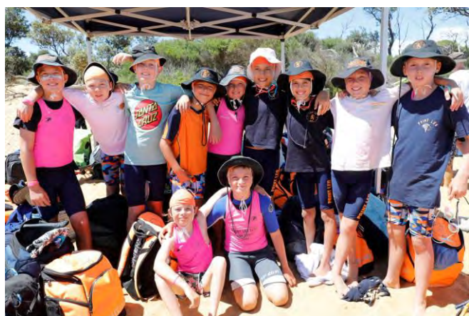
Figure 16. Under 12 boys at Mount Martha junior carnival

The Junior Competition team has enjoyed a very successful season over the 2023/24 period. We had Point Leo Nippers competing at over five carnivals over the summer period as well as the Junior State Titles at Warrnambool and the Australian titles in Queensland.