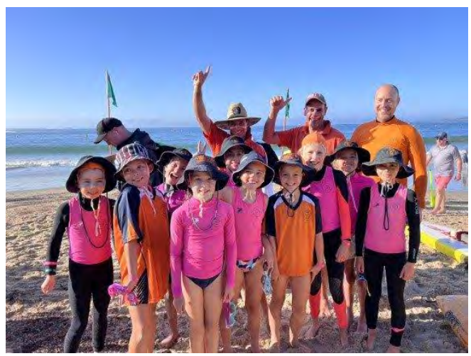
Figure 2. Nippers on a sunny Pt Leo day

It's important to recognize that all our Junior Programs thrived because of the incredible contributions of parents and Club member volunteers. Your commitment to delivering high-quality programs was truly commendable, and I am grateful for your ongoing support and dedication.