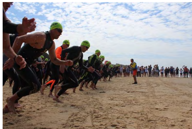
Figure 24. Swimmers starting the 1.2km Pt Leo Swim Classic