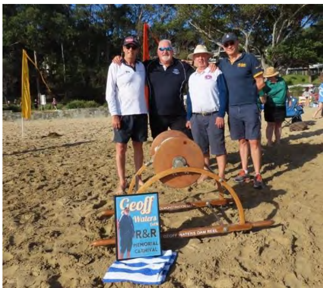
Figure 23. Officials pay respects at Lorne carnival