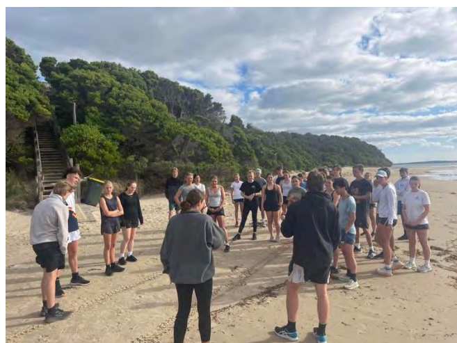
Figure 1. Bronze camp doing their daily fitness activities

It was inspiring to witness the enthusiasm of our new SRCs as they embarked on their patrolling and water safety duties. Their eagerness to contribute to the Club is truly commendable. Similarly, our young Bronze members demonstrated remarkable dedication to their roles. This season, many Bronze Medallion participants opted for supervised camping organised by parents, a decision that proved effective and reaffirmed the practicality of repurposing bunk rooms into a caretaker and multipurpose space, which has seen extensive use.