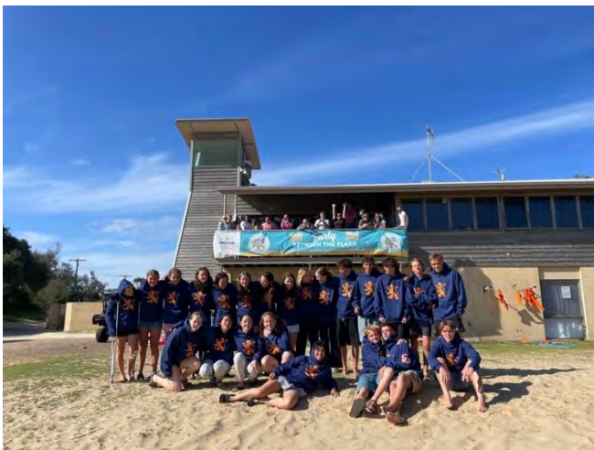
Figure 8. New Bronzies showing off their bronze jumpers

Bronze Medallion: 38 individuals exhibited dedication and proficiency in completing their Bronze Medallion, thereby enhancing their skills in aquatic safety and rescue procedures.