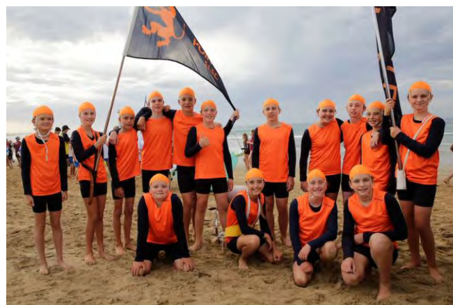
Figure 17. Junior march past team at state championships, Warrnambool