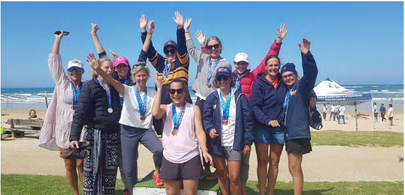
Adult Bronzies competing at State Masters Champs!