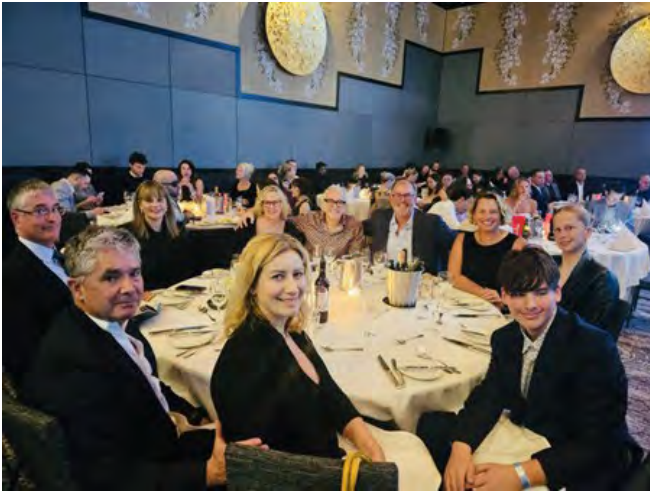
LSV AOE - Point Leo Finalists