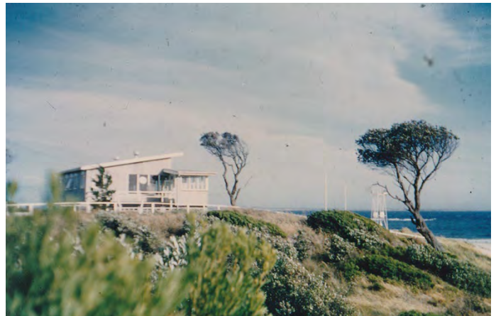
Old Pt Leo Clubhouse

Point Leo SLSC officially commenced operations on 1 st April 1955 (yes, April Fool's Day and fifty years after bathing on beaches became legal) and in the period between that opening date and 19 months later, in November 1956, twenty-five new members to the club had gained their Bronze Medallion. There were a few other members who had transferred, fully qualified, from other clubs and there were a number of new members who were not yet aged 16 but who had gained their Qualifying Certificate.