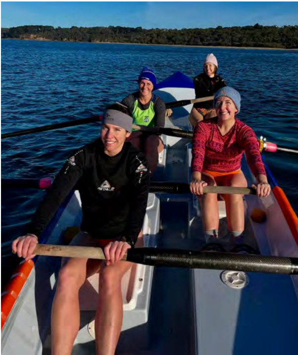
The Mimosa's in action