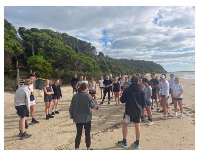
Figure 1. Bronze camp doing their daily fitness activities

It was inspiring to witness the enthusiasm of our new SRCs as they embarked on their patrolling and water safety duties. Their eagerness to contribute to the Club is truly commendable. Similarly, our young Bronze members demonstrated remarkable dedication to their roles. This season, many Bronze Medallion participants opted for supervised camping organised by parents, a decision that proved effective and reaffirmed the practicality of repurposing bunk rooms into a caretaker and multipurpose space, which has seen extensive use.