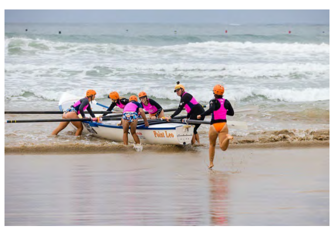
Figure 13. The Mimosa's at state championships, Ocean Grove